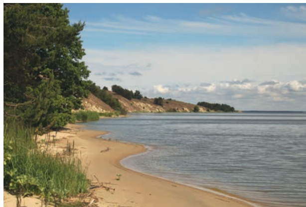
Curonian Spit

The project partners and associated partners include World Heritage sites and Biosphere Reserve Areas in the South Baltic region who face similar conservation, preservation and social challenges.