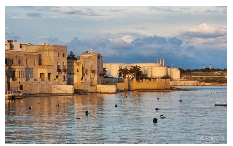
View from Birżebbuġa

Climate-MATCH develops a holistic Strategic Framework covering governance, operations, and coordination across different sectors for collaborative management and monitoring of climate change risks to the Maltese Islands. The initiative is funded by the European Commission's Directorate General for Structural Reform Support (DG REFORM) upon request of the Maltese Public Works Department, the Ministry for Transport Infrastructure and Public Works (MTIP) and the Ministry for Environment, Energy and Regeneration of the Grand Harbour (MEER).